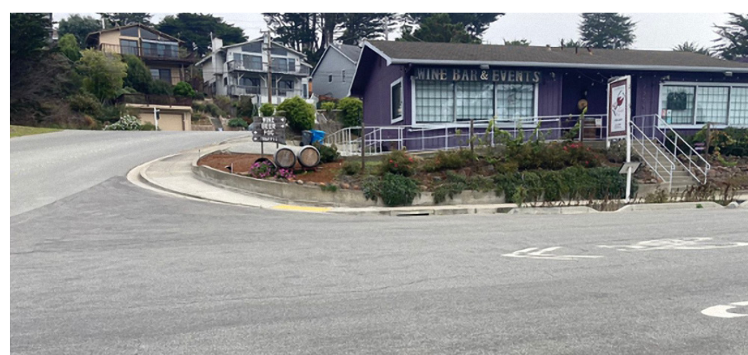
Carlos St and Etheldore St looking north