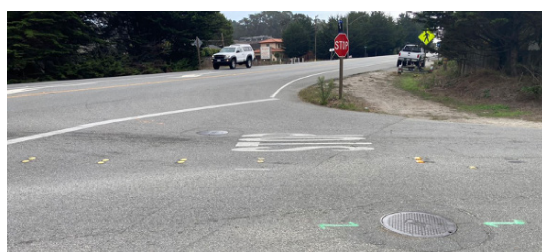
Cypress Ave looking south