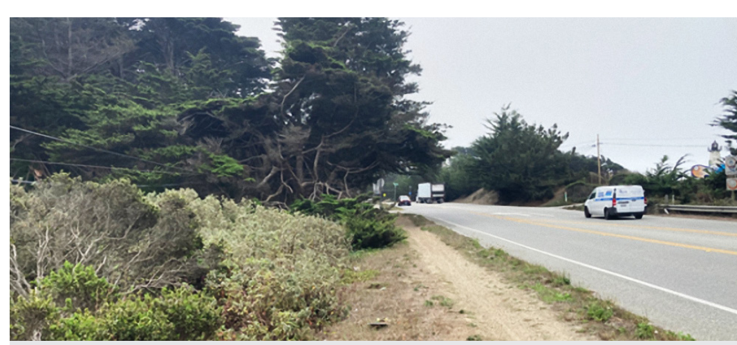
Northbound shoulder SR 1 near 16th St looking south