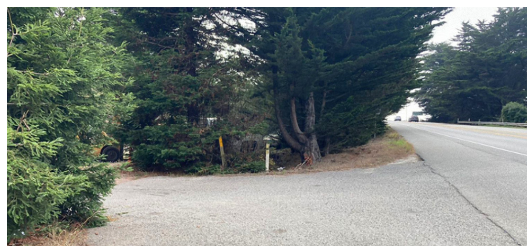
Driveway along northbound SR 1, south of Marine Blvd looking south