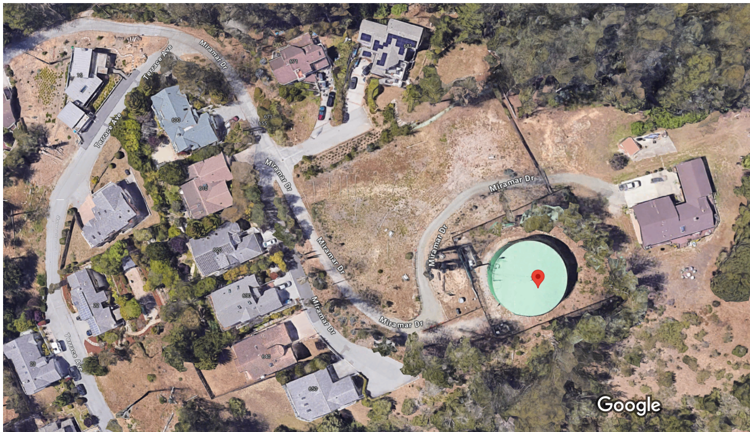
50 ft